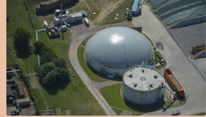
Anaerobic Digestion (AD)

IVCs can be used to treat food and garden waste mixtures. In an enclosed environment, with accurate temperature control and monitoring. A suitable route for industrial composting of food packaging.