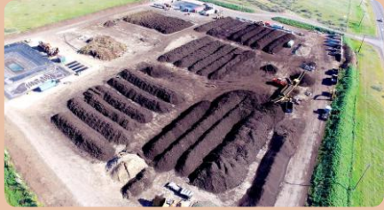
Open Windrow Composting

Notpla works with EnVar, UK's largest composting facility, to compost our packaging at the end of life in their in-vessel composting sites.