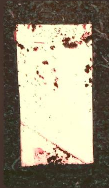
PLA coated board