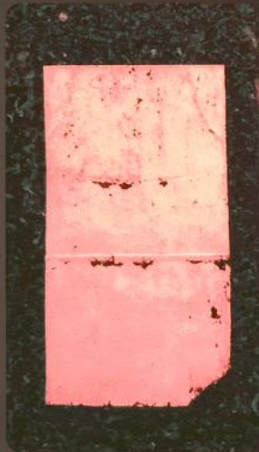
notpla coated board