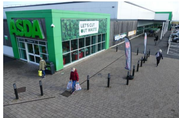
Asda's sustainability superstore at Middleton, Leeds.

Enter your postcode for local news and info Enter your postcode Go In YourArea